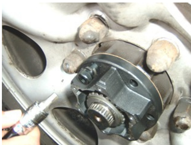
9: Above you can see the hub body and new bolts fitted