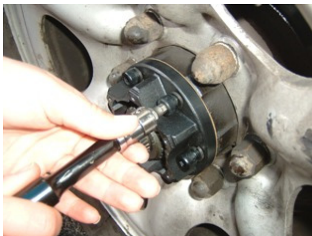
9: Torque all six new bolts to manufactures original auto hub specifications