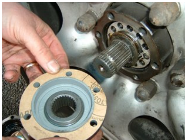
8: Dry fit gasket to manual hub body