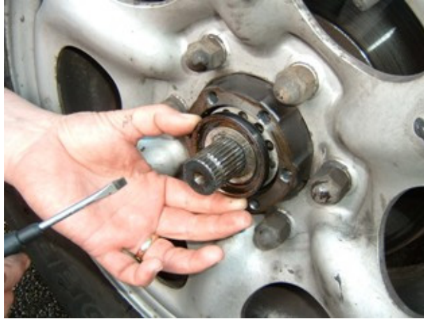
5: Remove the two washers and snap-ring