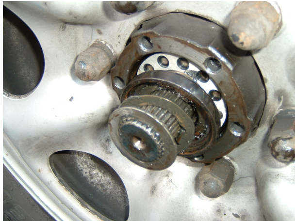
Detailed view of the three parts to remove on driveshaft and as shown below